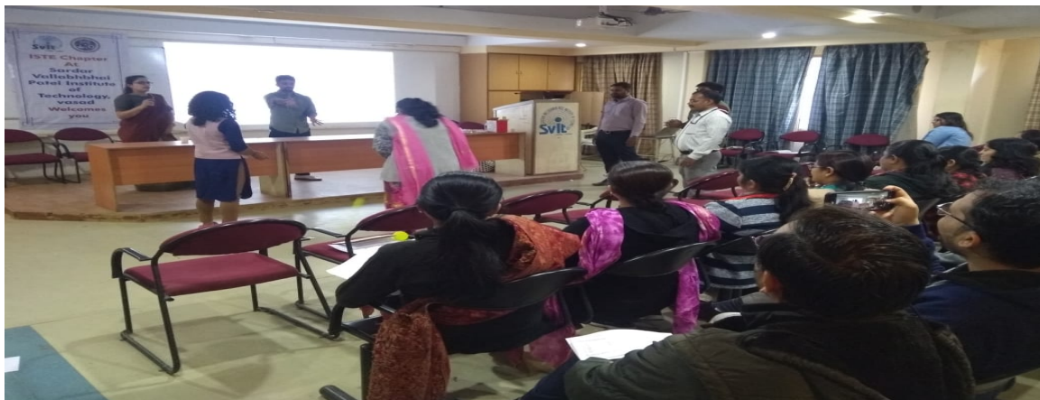
Principal Sir and Faculty members from all the departments attended the session